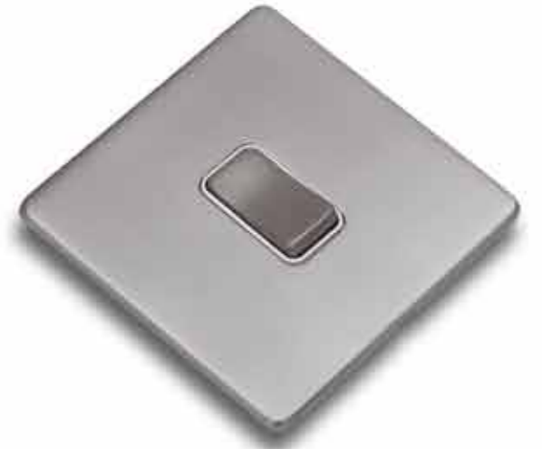
Satin Nickel SE-23