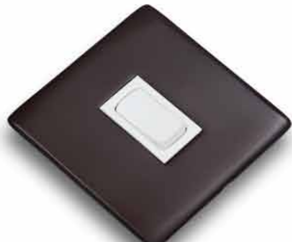
Antique Bronze S-33