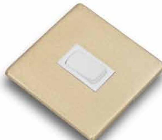
Brushed Brass S-11