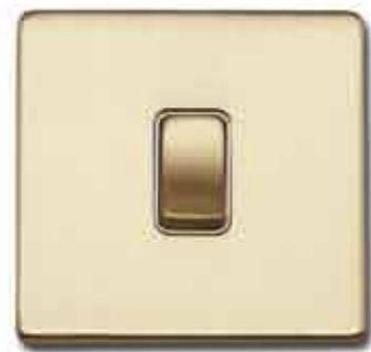
One Gang 88x88 mm

The Studio Elite Range is available in Six sizes