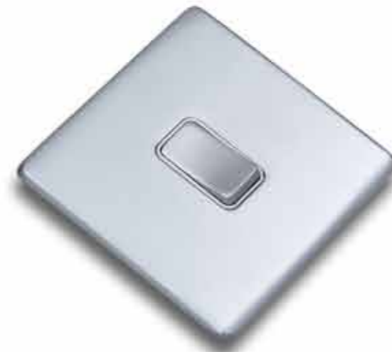
Satin Chrome SE-22