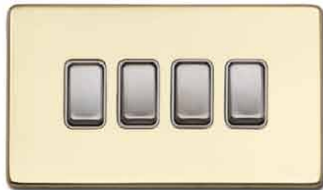
Four Gang 88x148 mm