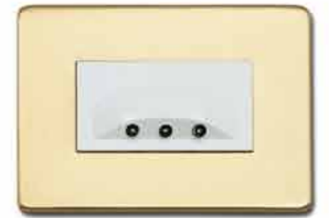
Three Gang 88x118 mm