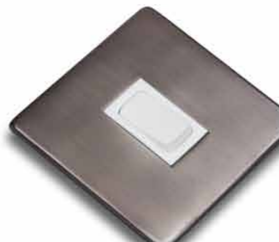
Antique Nickel S-32