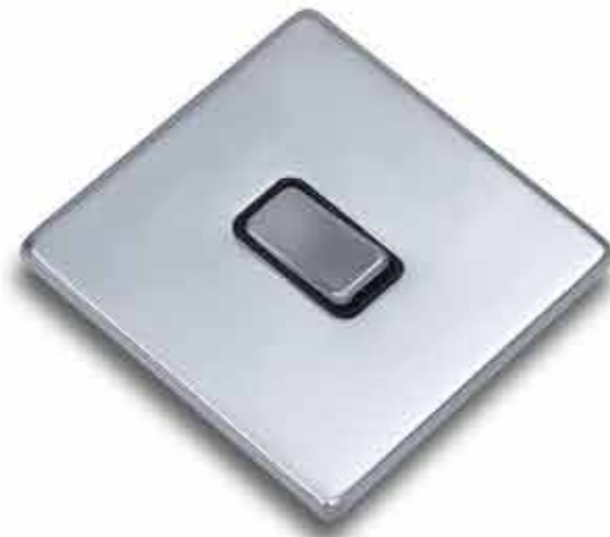
Polished Chrome SE-02