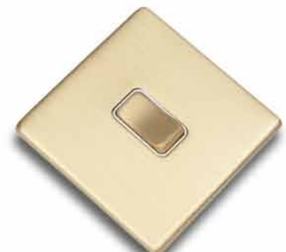
Satin Brass SE-21