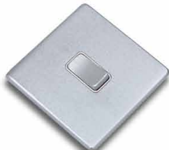
Brushed Chrome SE-12