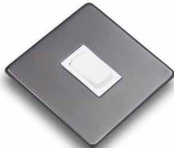
Polished Black Nickel S-03