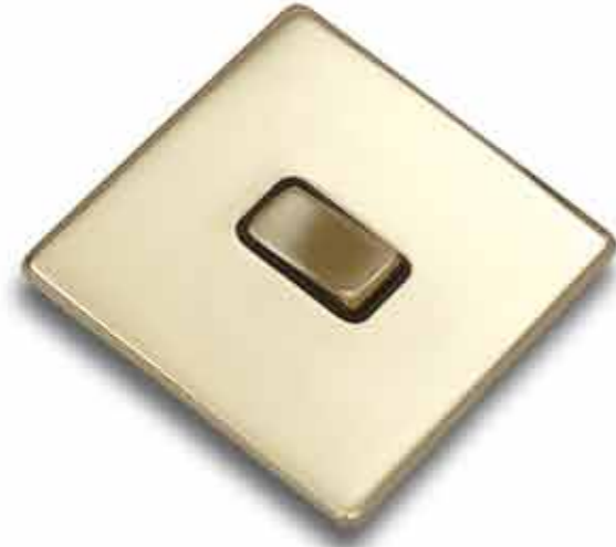
Polished Brass SE-01