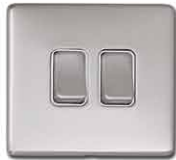
Two Gang 88x88 mm