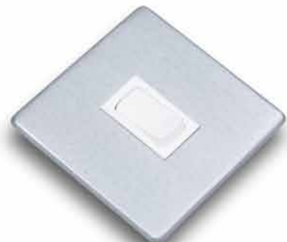
Brush Chrome S-12