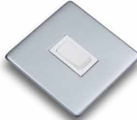
Satin Chrome S-22