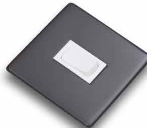
Satin Black S-24