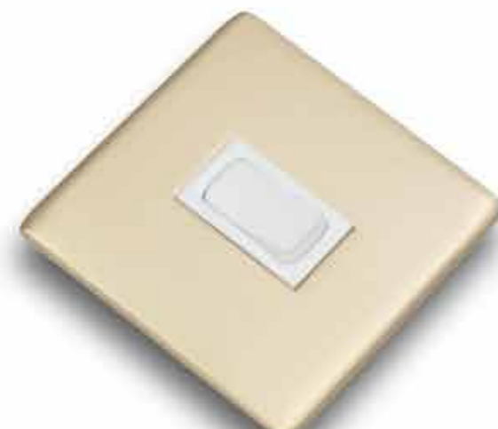
Satin Brass S-21