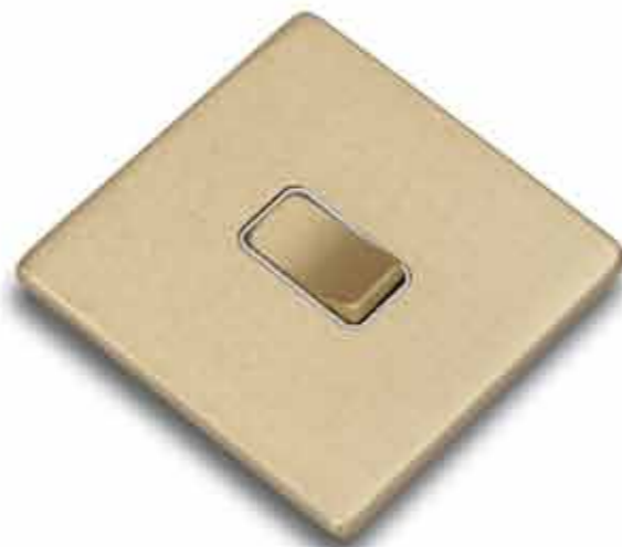
Brushed Brass SE-11