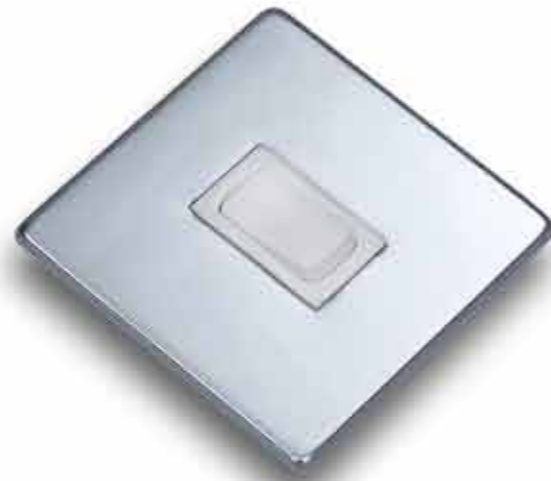
Polished Chrome S-02