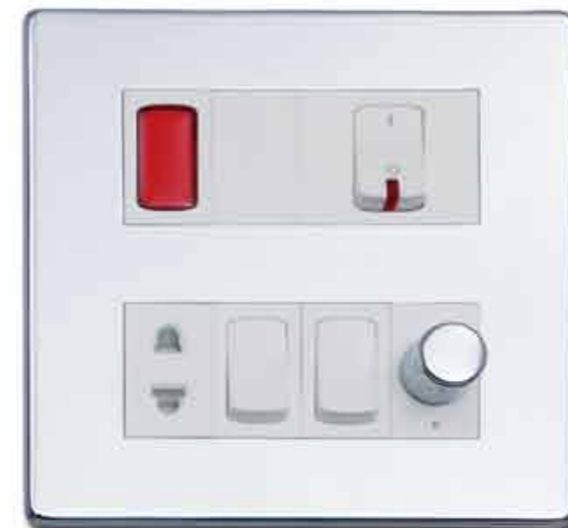
Eight Gang 148x148 mm