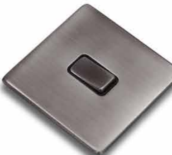
Antique Nickel SE-32