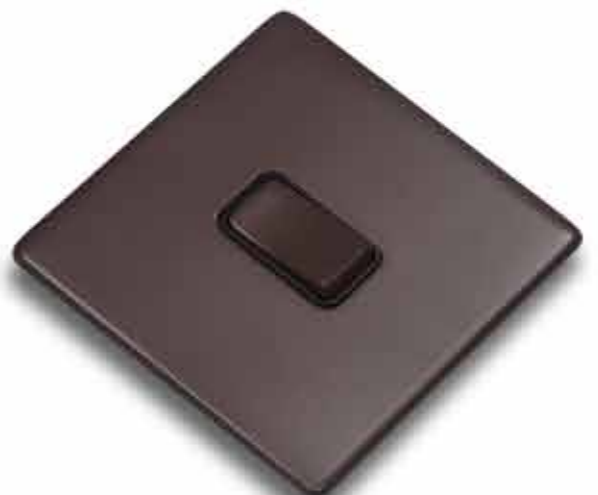
Antique Bronze SE-33