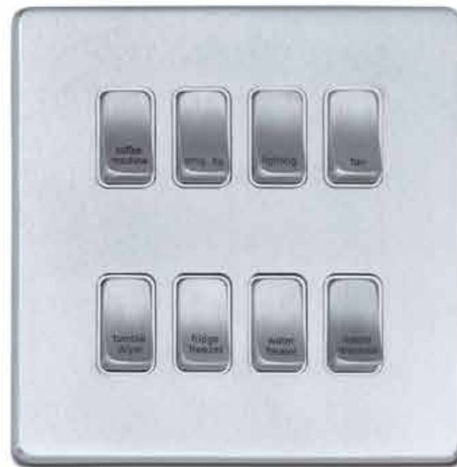
Eight Gang 148x148 mm