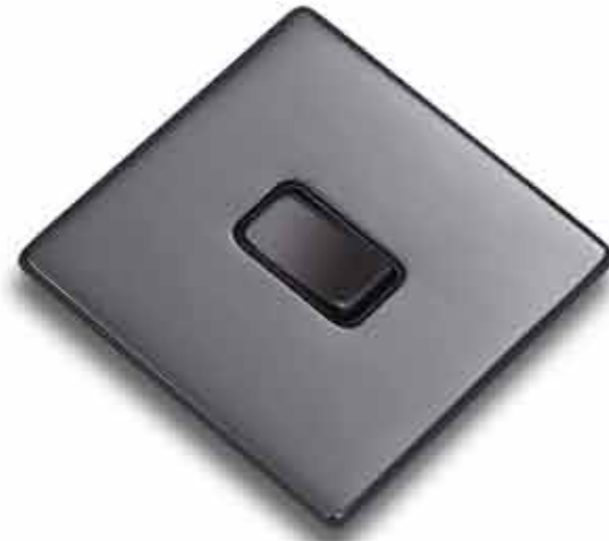
Polished Black Nickel SE-03