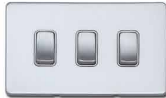
Three Gang 88x148 mm