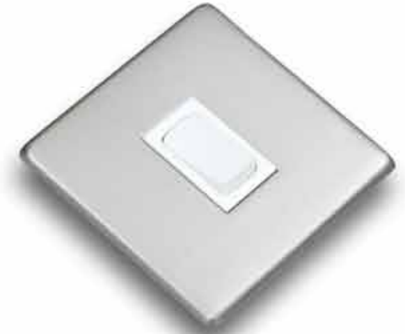
Satin Nickel S-23