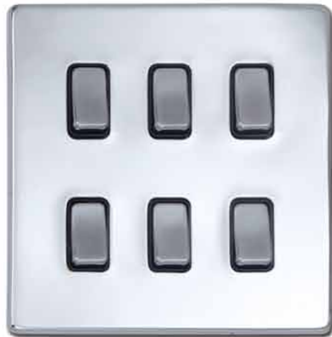
Six Gang 148x148 mm