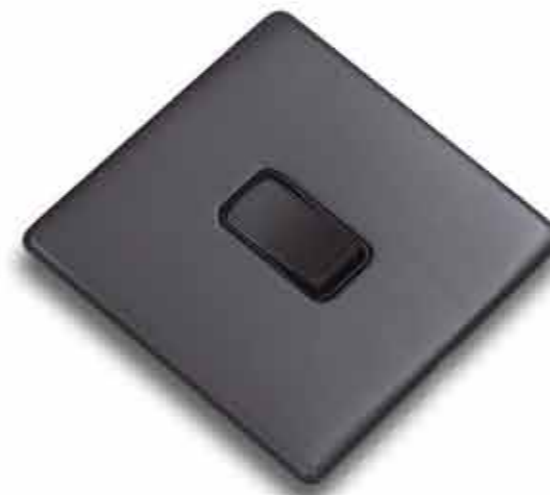
Satin Black SE-24