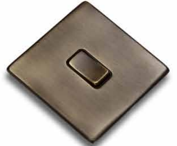
Antique Brass SE-31