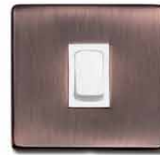
One Gang 88x88 mm

The Studio Range is available in Six sizes