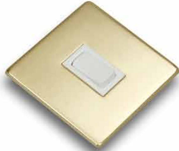
Polished Brass S-01